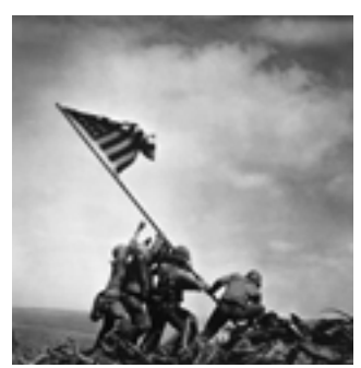
Iwo Jima flag raising